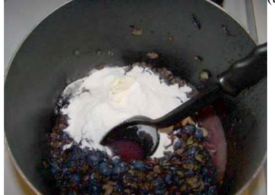
Step 9 - Add the remaining sugar and bring to a boil

(the kind that can not be stirred away).