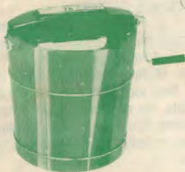
4 Qt. Hand Operated Ice Cream Freezer