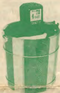
4 Qt. Electric Ice Cream Freezer